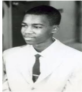
Ernest Greene Member of the Little Rock Nine