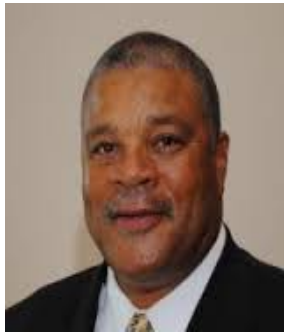
Emery Moorehead Super Bowl Champion Chicago Bears