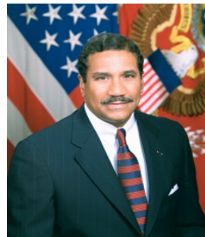
Togo West Former Secretary of Veteran Affairs