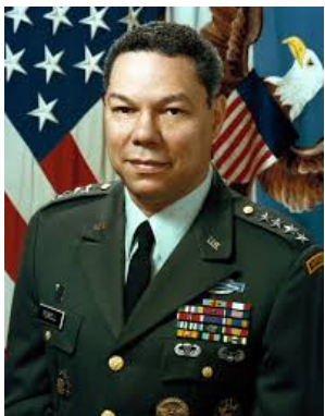
General Colin Powell