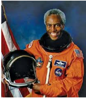
Guion Bluford 1st African American in Space